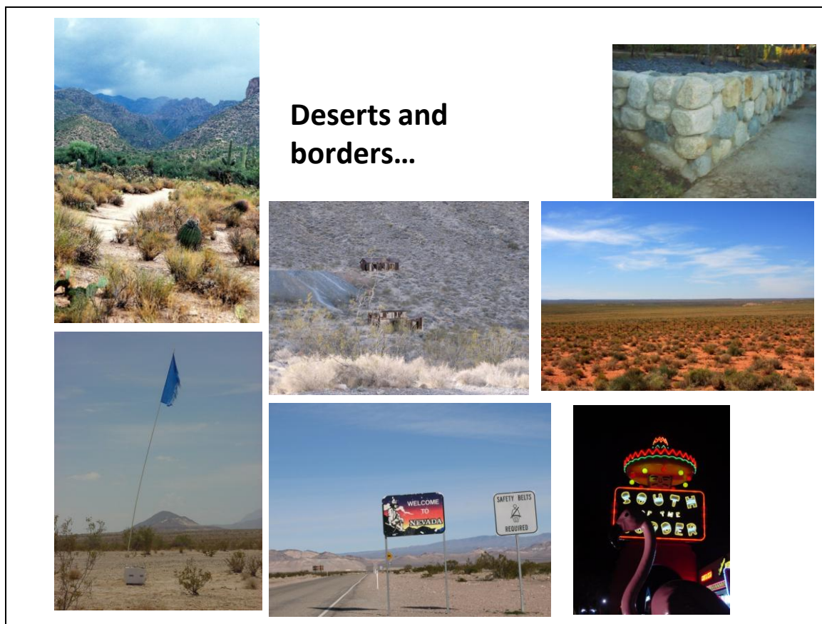
Illustration 3: Deserts and borders